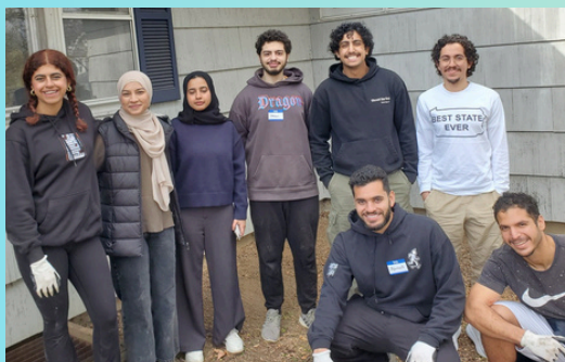
Arabian Youth Society volunteer work day

Southern Unit: A single story, ADA-accessible, 2-bd, 1-bath; Northern Unit: Two-story, 3-bd, 2-bath