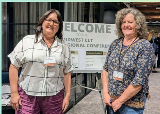
Seeing friends at Midwest CLT Conference