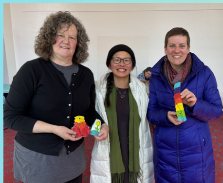
Jana Marie Foundation event