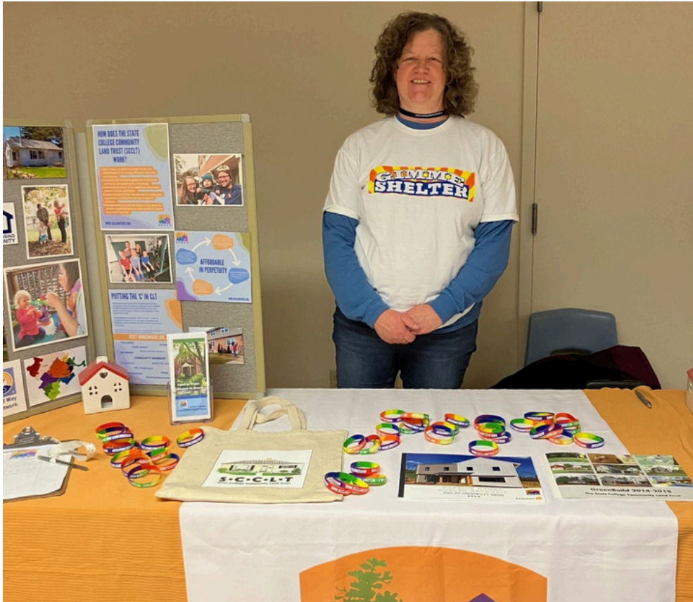
In the Community, pg. 6

A PUBLICATION OF THE STATE COLLEGE COMMUNITY LAND TRUST