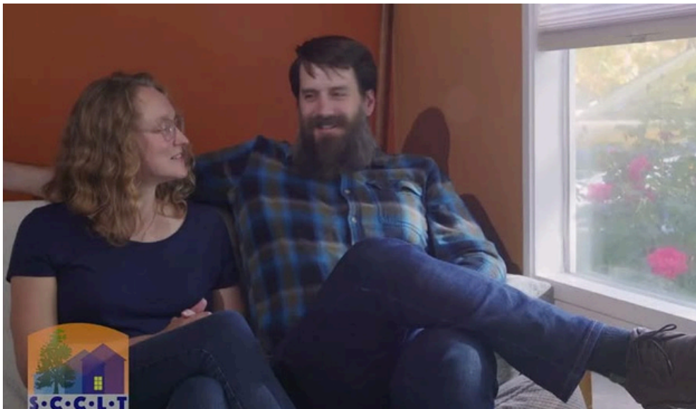
Homeowner Highlights, pg. 3