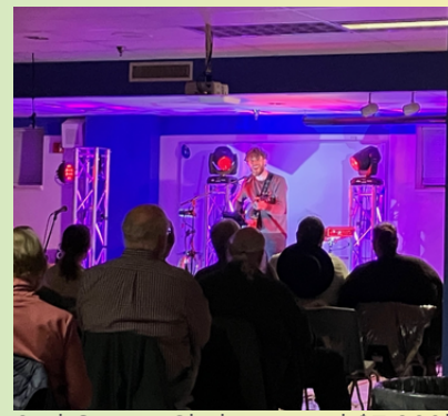
2nd Gimme Shelter raised $7,280!