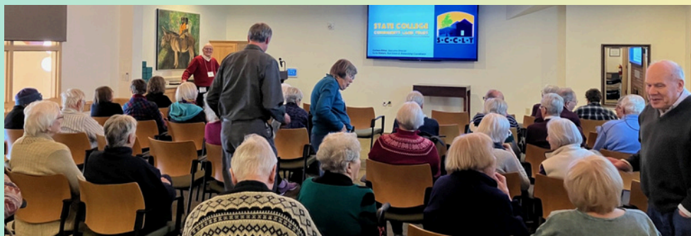
Presentation to Foxdale