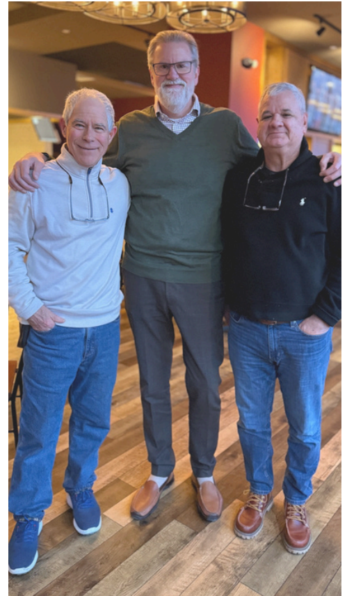
Board Changes, pg. 7